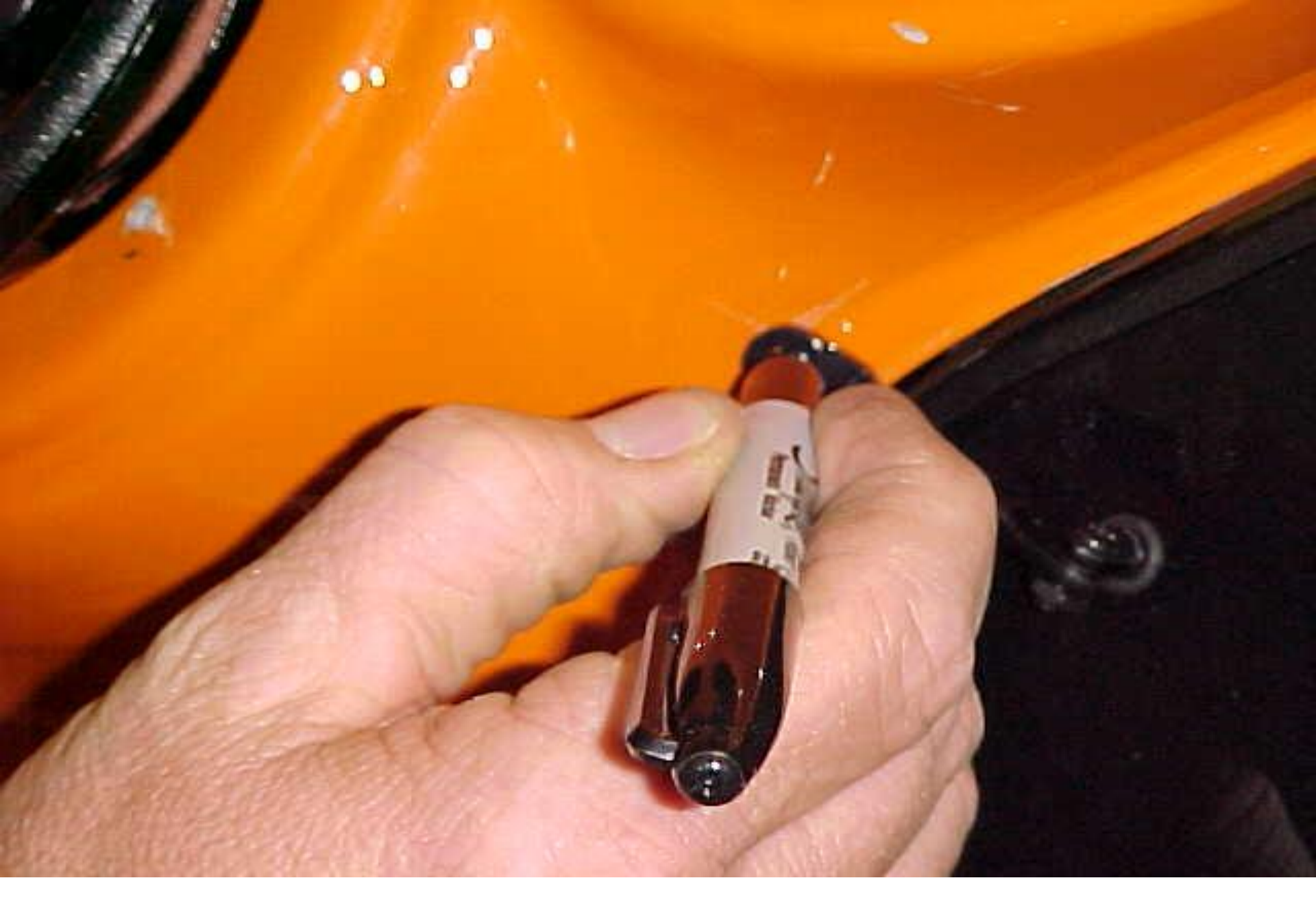
Using a sharpie, align the freedom wing with the side of the fairing and mark two holes.