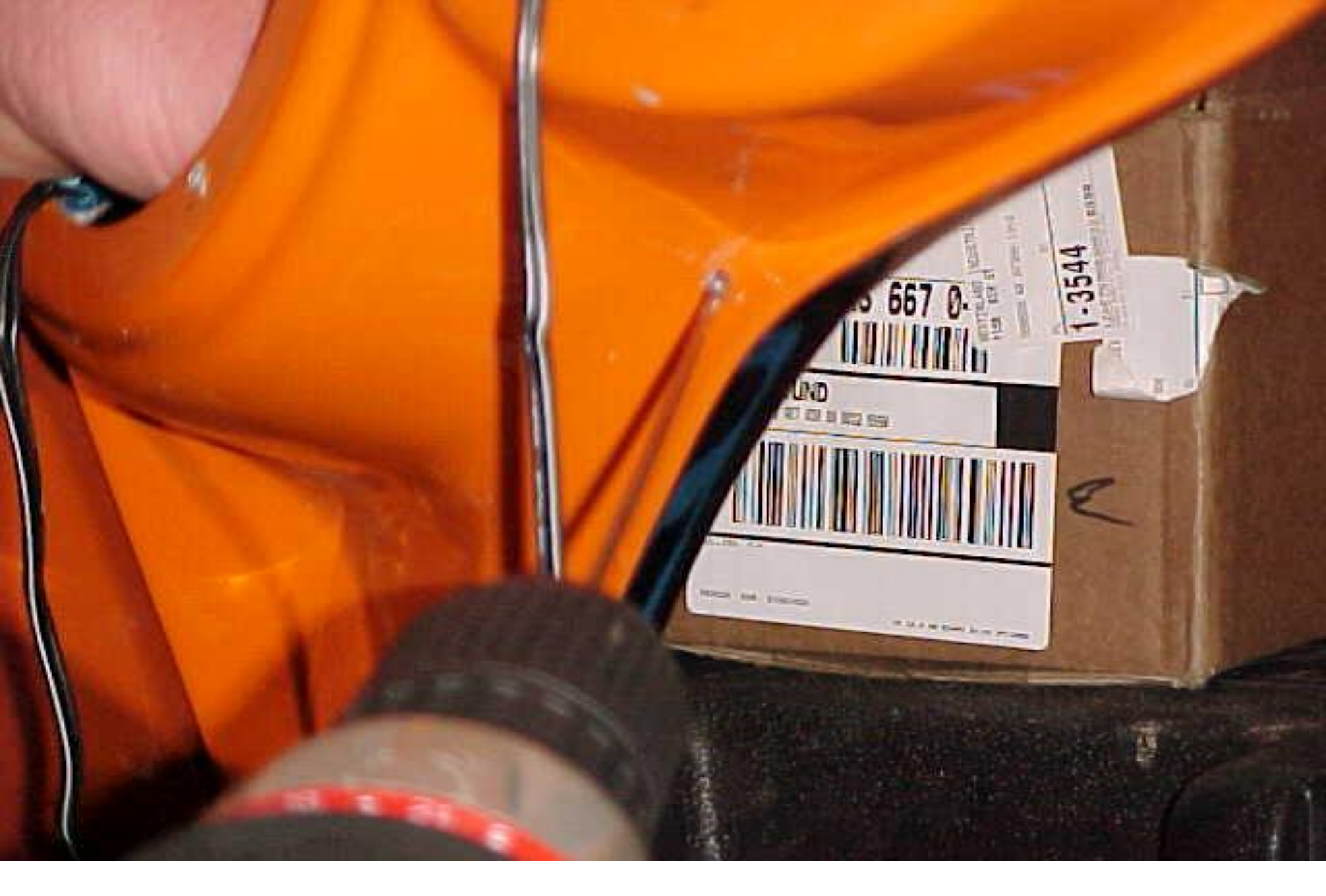
Using a 1/16 drill bit, drill through the fairing and through the reinforcement piece.