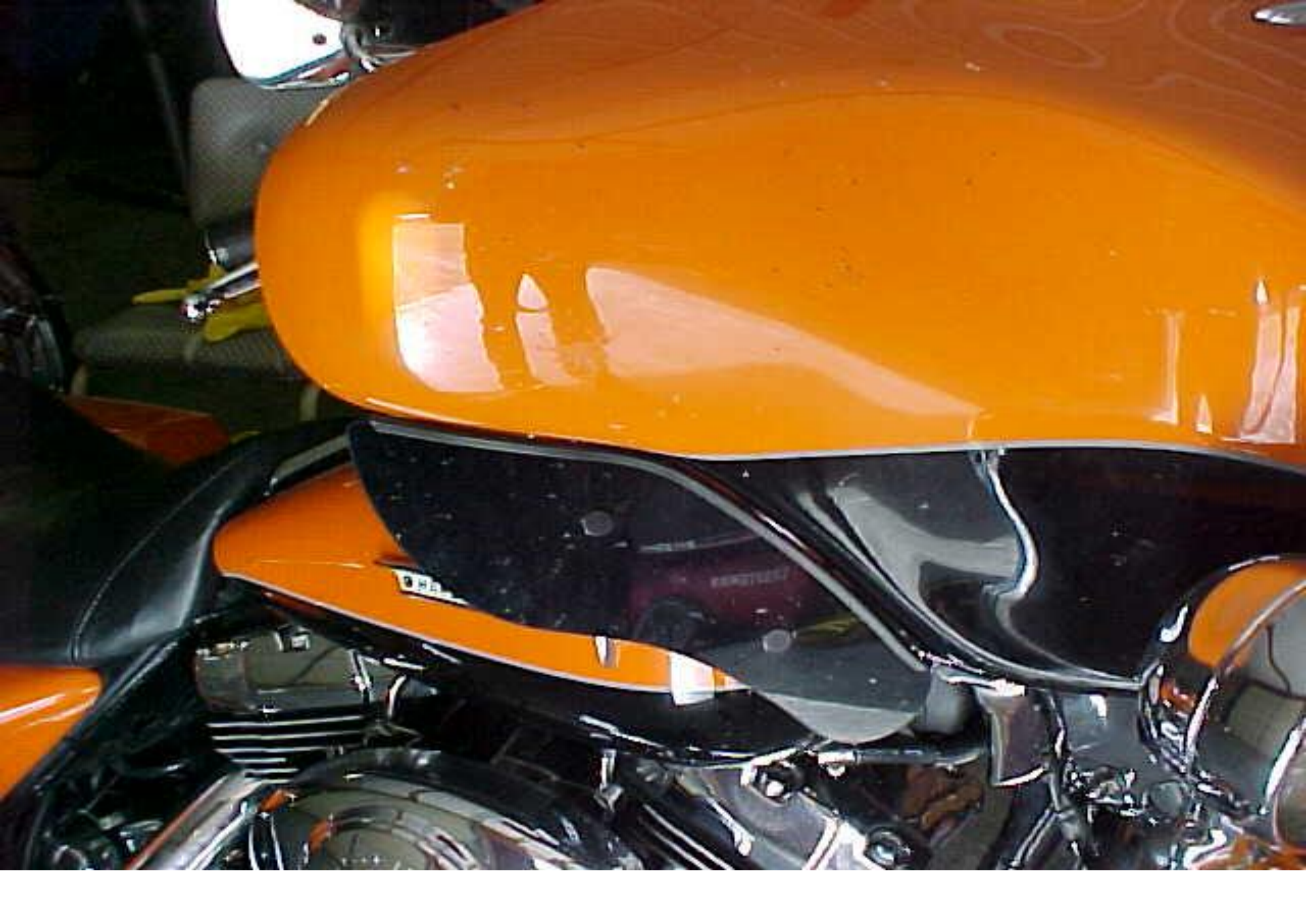
The finished product!