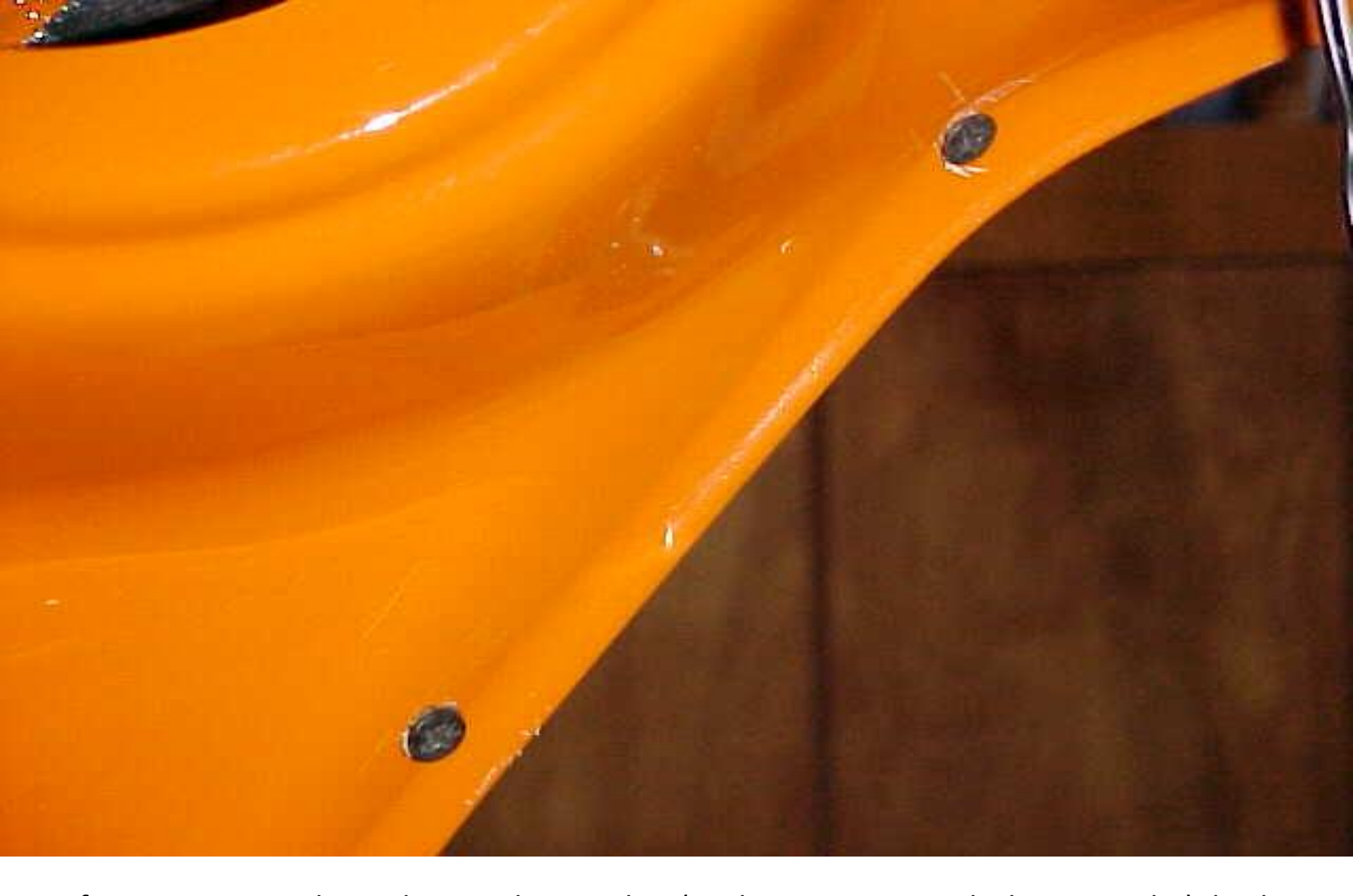
After 20 minutes, depending on the weather (cooler temps may take longer to dry), back the screws out and attach the brackets of the freedom wings to the reinforced piece using the same two screws.