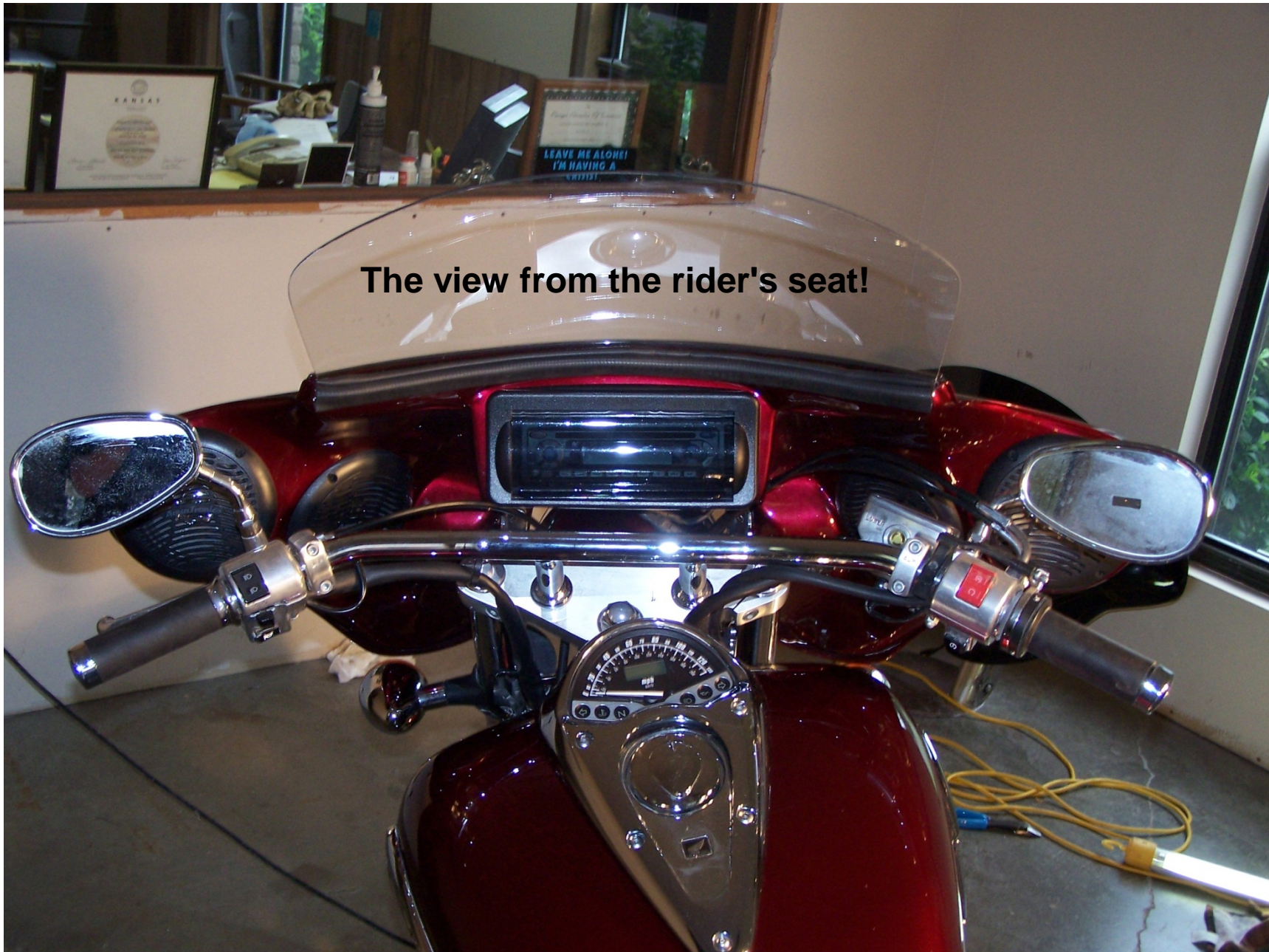
The view from the rider's seat!