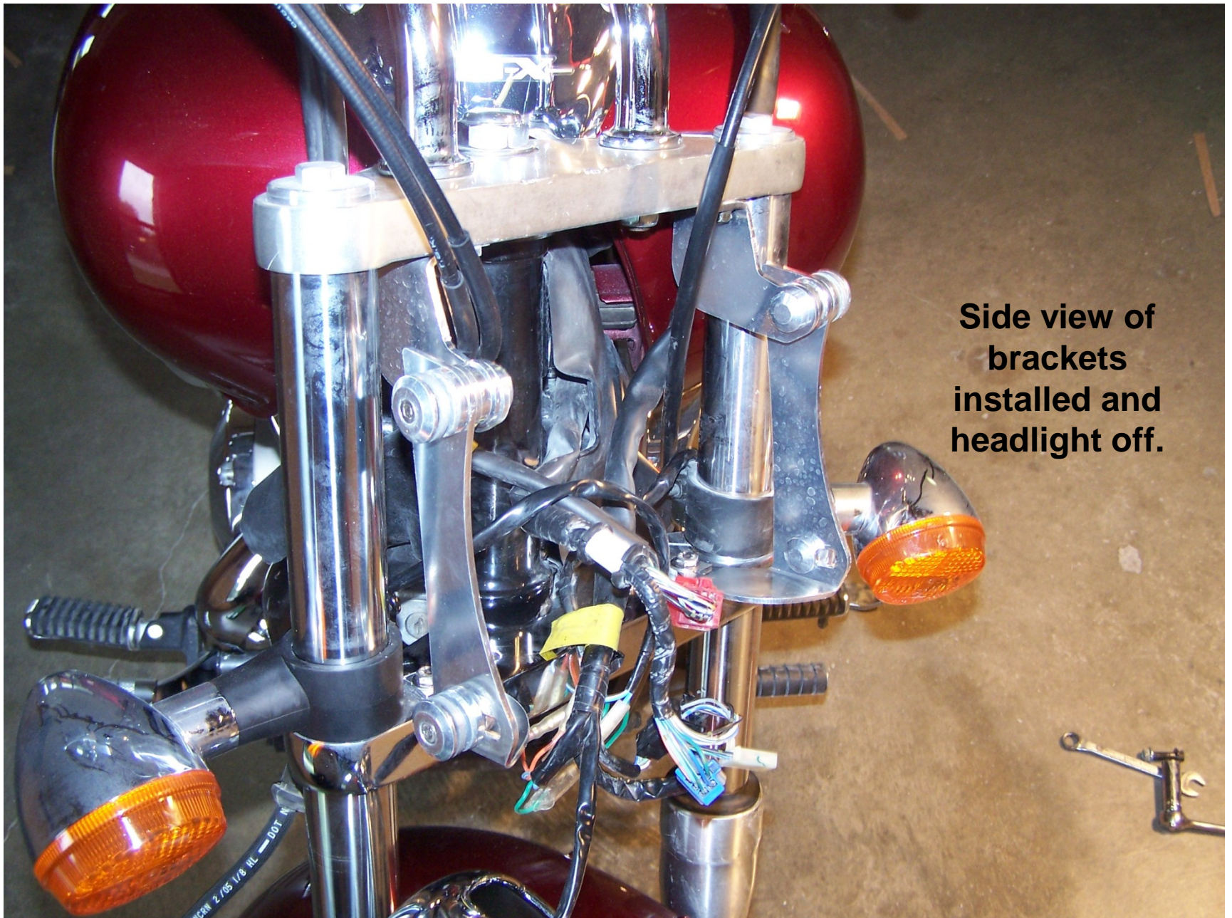
Side view of brackets installed and headlight off.