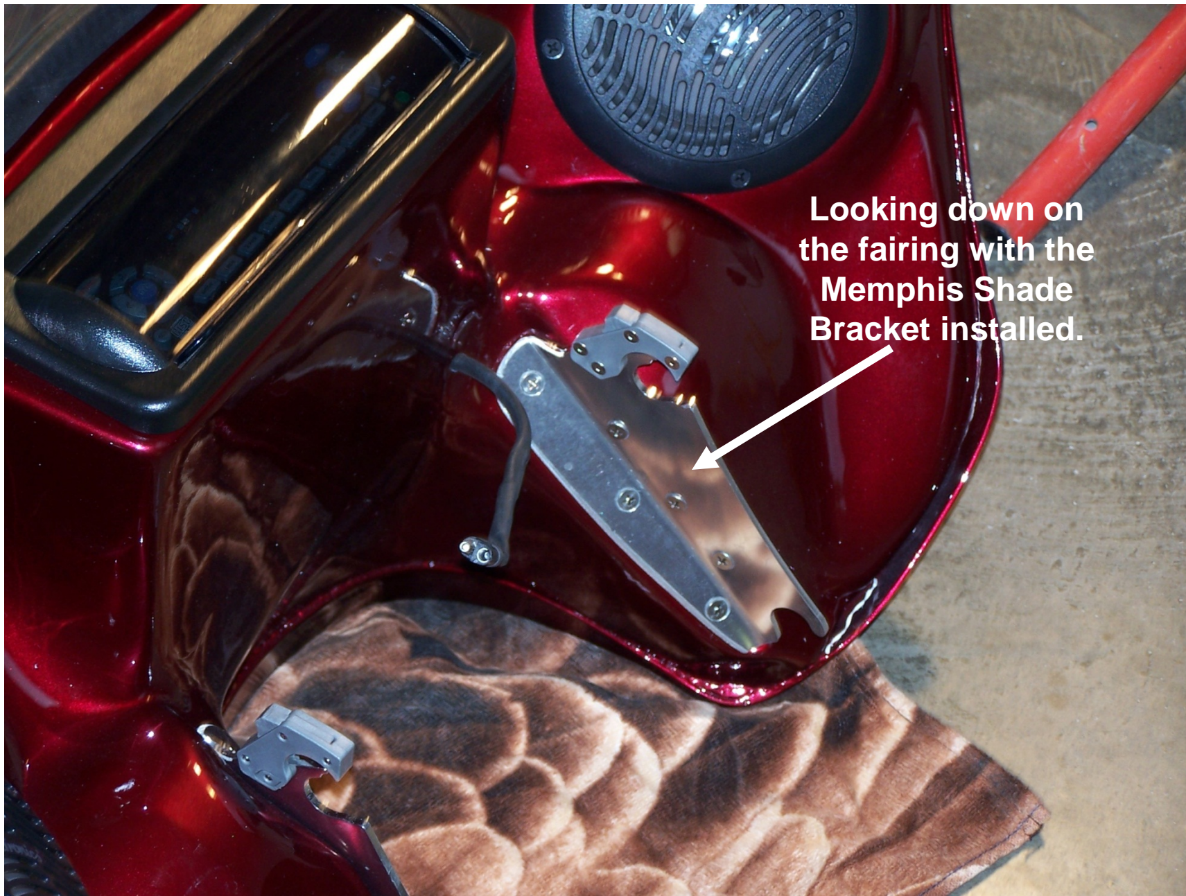
Looking down on the fairing with the Memphis Shade Bracket installed.